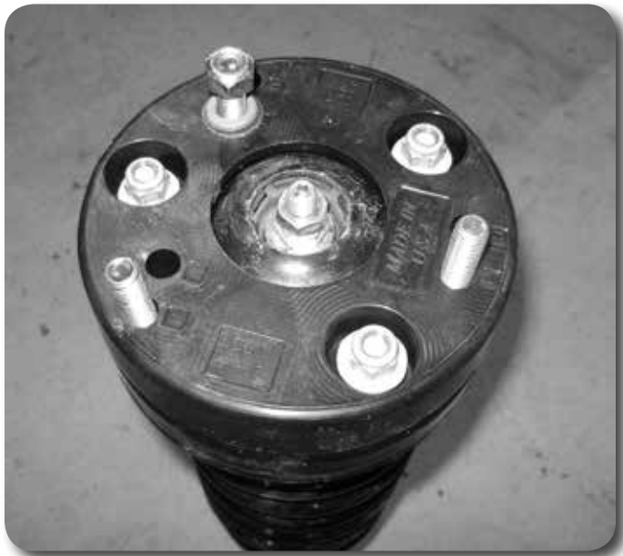
Figure 9 - Passenger's Side Shown