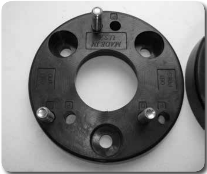
Figure 8C - Driver's Side Shown